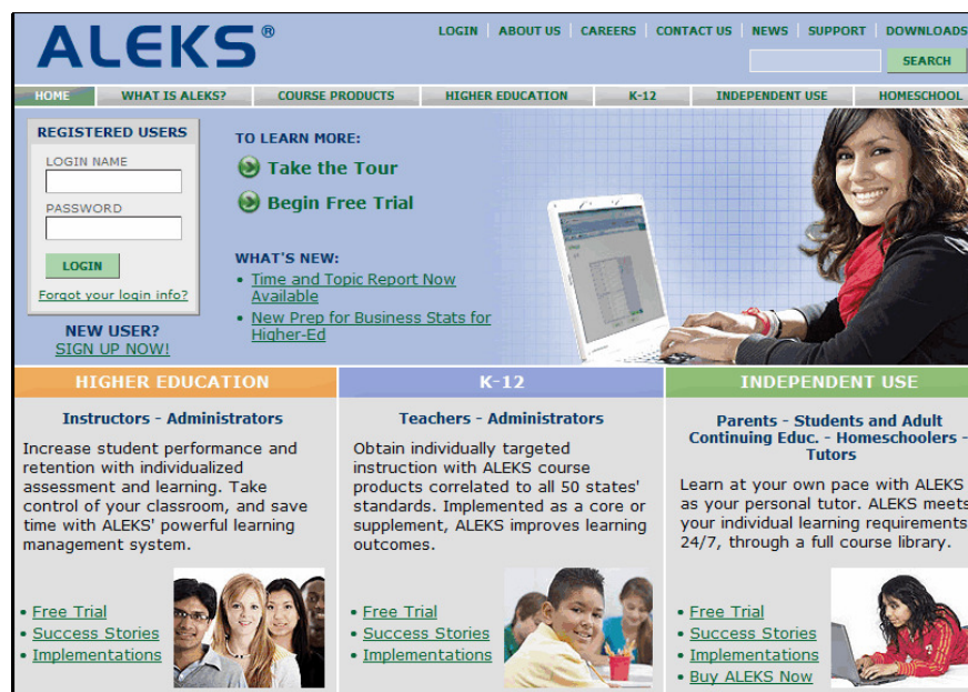
Figure 1: The ALEKS Website

For your convenience, add a “Bookmark” or “Favorite” at this location. This is the site where you will log on to your account.